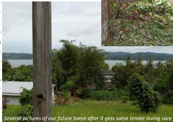
Several pictures of our future home after it gets some tender loving care