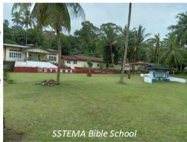
SSTEMA Bible School